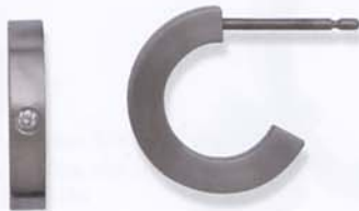
CONNECTED Stainless steel & titanium earrings w/ diamonds (0.02 ctw) $250 DT00014