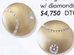
18K gold earrings w/ diamonds (0.74 ctw) $4,750 DT00034