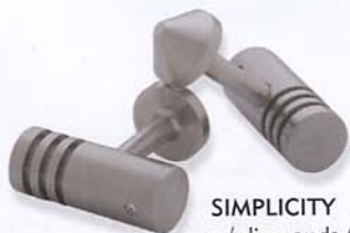
SIMPLICITY Men's stainless steel cuff links w/ diamonds (0.02 ctw) $245 DG00001