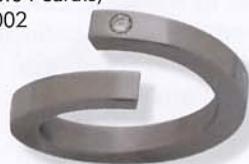
CONTEMPLATION Stainless steel ring w/ diamond (0.04 carats) $230 DM00002