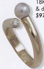
18K gold ring w/ cultured pearl (6mm) & diamond (0.10 carats) $975 PK00003