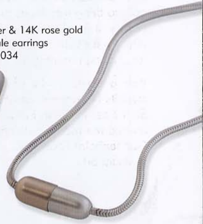
Sterling silver snake chain with 14K rose gold screw capsule pendant 16" length $265 FN00071