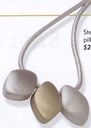
Sterling silver & 18K gold diamond pill necklace 18" length $295 FN00067