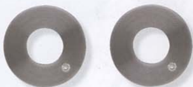
DELICACY Stainless steel & titanium earrings w/ diamonds (0.02 ctw) $245 DT00011