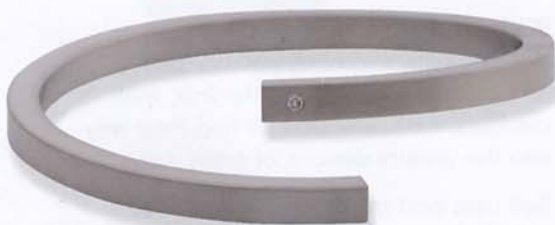
OPENNESS Stainless steel bracelet w/ diamond (0.04 carats) 8 1/4" length $265 DB00003