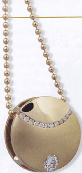
18K gold pendant w/ diamonds (0.37 ctw) 17" length $2,400 DY00050