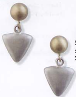
Sterling silver & 18K gold sleeping pill earrings $110 FE00033