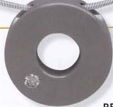
RESONANCE Stainless steel pendant w/ diamond (0.04 carats) 16" length $255 DY00026

The XEN collection is sleek, cool, and slightly avant-garde. It combines satin matte-finished stainless steel and the finest diamonds with the highest quality in European workmanship. Unique names imbue each piece with individual character and style.