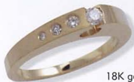
18K gold ring w/ diamonds (0.16 ctw) $990 DK00072