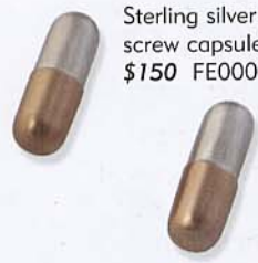
Sterling silver & 14K rose gold screw capsule earrings $150 FE00034